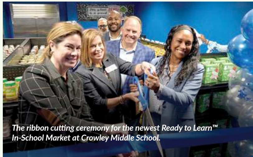
The ribbon cutting ceremony for the newest Ready to Learn ™ In-School Market at Crowley Middle School.